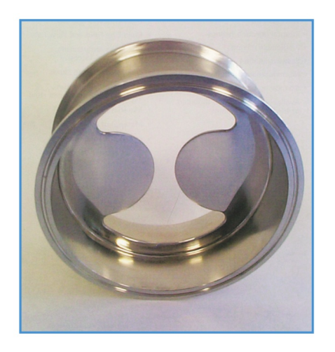
<u>Westfall Model 2800</u> and <u>2850 mixers</u> can be fabricated to meet NSF (National Sanitation Foundation) International Product Testing & Certification Standards